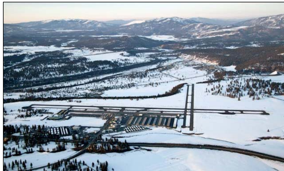
The Truckee Tahoe Airport is situated in both Nevada County and Placer County

The Truckee Tahoe Airport is situated in both Nevada County and Placer County (see photo on right), therefore a special ALUC with representatives from both counties is being formed. NCTC has authorized its staff to support the new Truckee Tahoe ALUC. NCTC