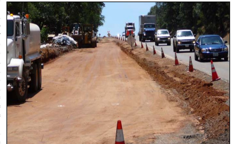
SR 49 NB Passing Lane Project from Combie Road to Brewer Road