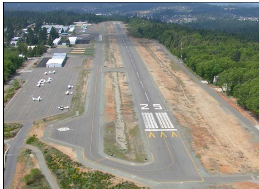
A CAL FIRE Air Tanker demonstrates its ability to drop fire retardant (top photo). Runway 25 at the Nevada County Airport in Grass Valley (above photo).

The NCTC was recently designated as the Airport Land Use Commission (ALUC) for the Nevada County Airport near Grass Valley by the Nevada County Board of Supervisors and members of the City Selection Committee, which represent Grass Valley, Nevada City, and the Town of Truckee. The NCTC authorized its staff to support the newly formed ALUC at their May 19 th meeting and approved a fee schedule as their first order of business. The California Public Utilities Code Section 2167.5 grants ALUCs the authority to charge fees for review of land use proposals and airport plans. The fees are charged to the proponents of actions, regulations, or permits, and are used to pay for services provided by the ALUC.